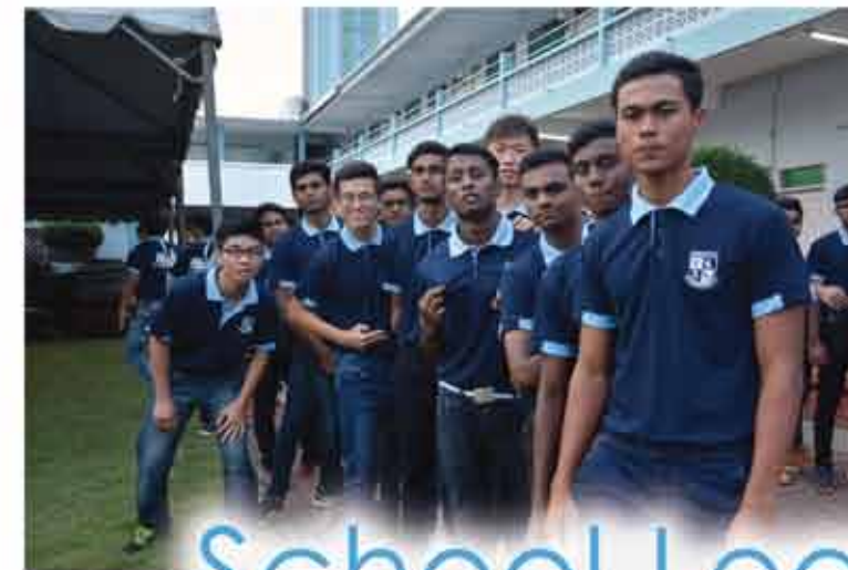
School Leavers Night