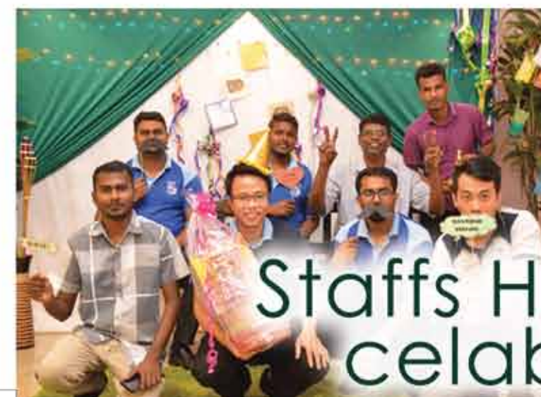
Staffs Hari Raya celebration