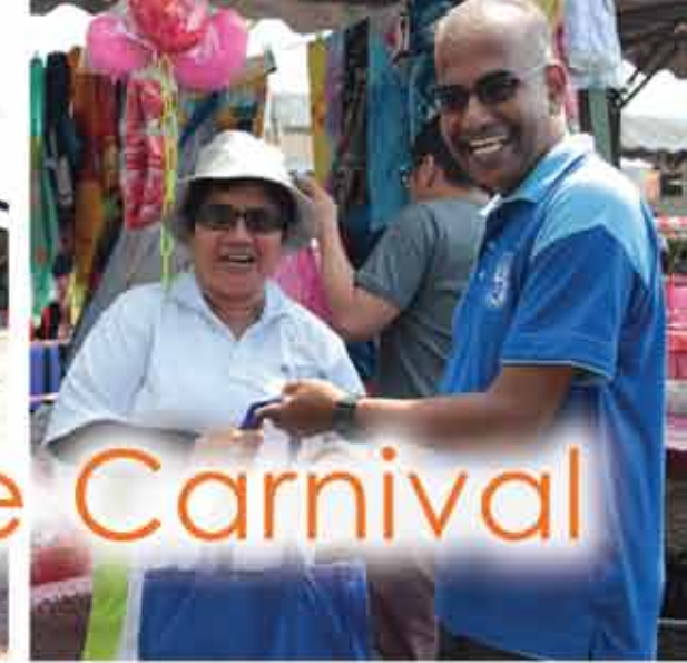
Open House Carnival